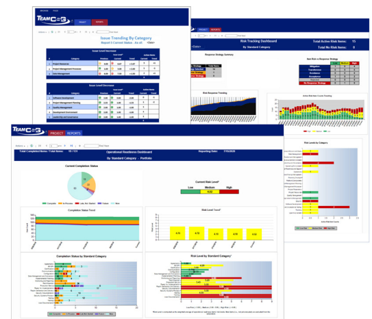
TeamCSG SM Project Management and TeamCSG SM Operational Readiness