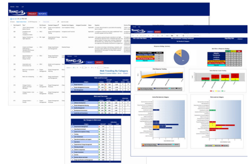
TeamCSG SM Risk Assessment Tracking and Reporting

Supports readiness and compliance reviews specifically focused on the CCWIS requirements.